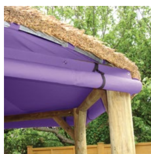
Side Panels (open)